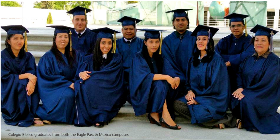
Colegio Biblico graduates from both the Eagle Pass & Mexico campuses